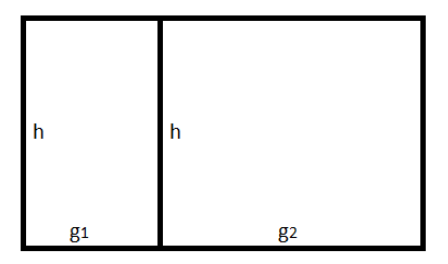
Figure 2: Divide the rectangle vertically.

In the same way as in Figure 2, we split the rectangle vertically with base heights g1 and g2 and the same height h.